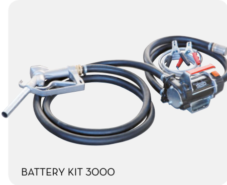
BATTERY KIT 3000