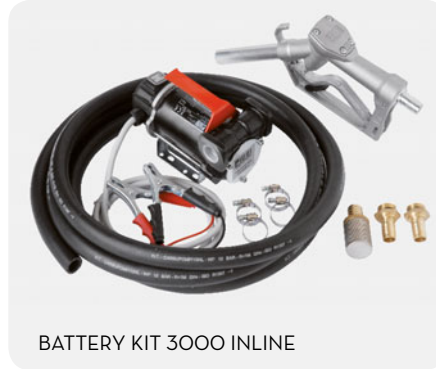
BATTERY KIT 3000 INLINE