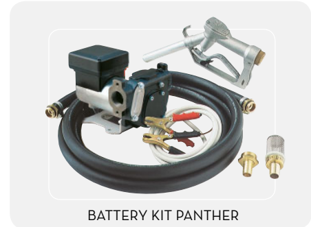
BATTERY KIT PANTHER