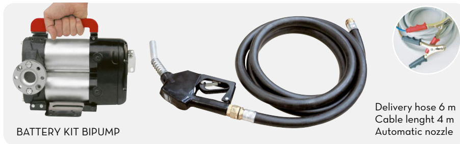
BATTERY KIT BIPUMP

Delivery hose 6 m Cable lenght 4 m Automatic nozzle