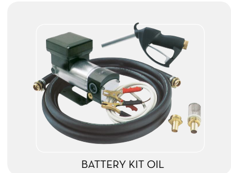
BATTERY KIT OIL

Delivery hose 6 m Cable lenght 4 m Automatic nozzle